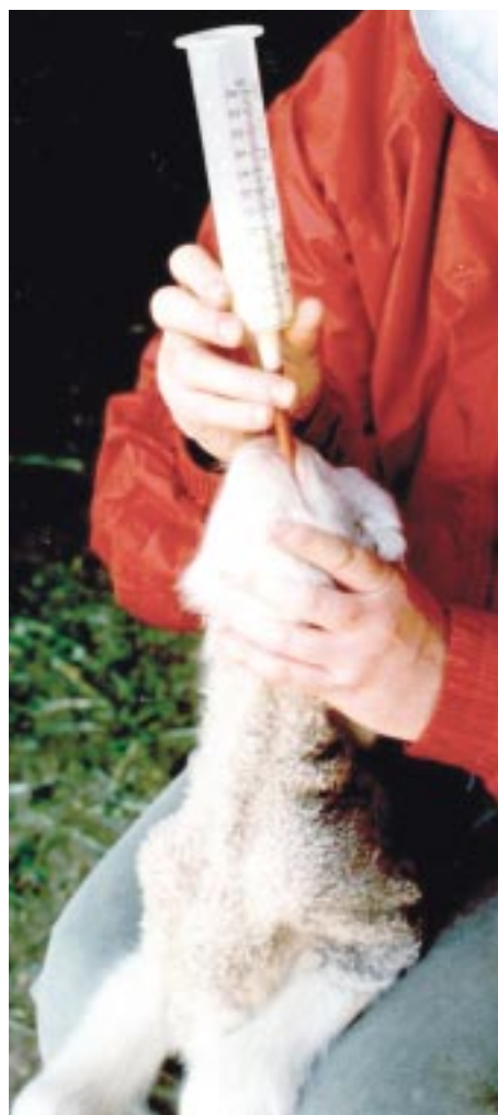
Figure 9. Let the fluid trickle into the neonate's stomach via gravity.

syringe with the warmed fluid (Figure 8). Let the fluid trickle in via gravity (Figure 9). Do not force it with the plunger, as the pressure could rupture the stomach or cause fluid to enter the lungs. Thick colostrum may not flow freely; it may need to be diluted with thinner colostrum. Try to keep air from entering the tube and stomach.