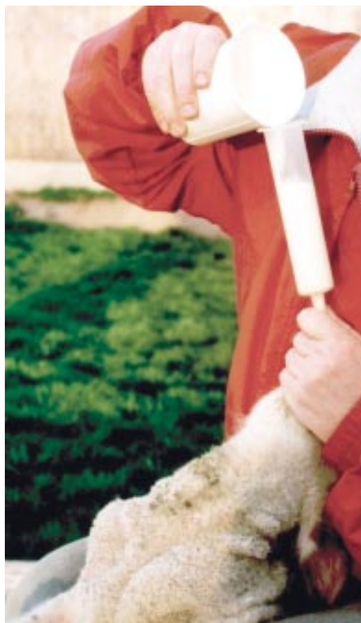
Figure 8. Attach the empty syringe to the feeding tube and fill with the warmed fluid.