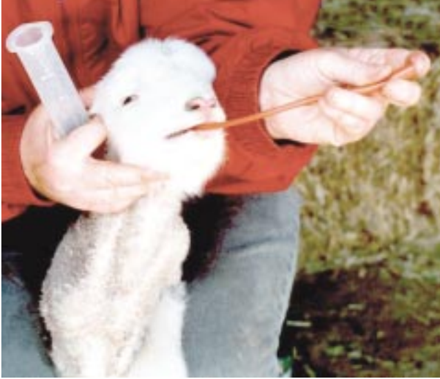
Figures 10. Crimp off the tube as you withdraw it to prevent fluid from entering the lungs.